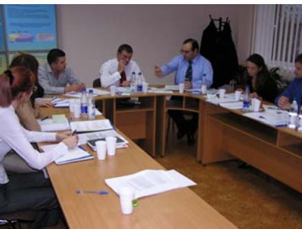
Training Participants discussing key performance indicators

The course was delivered from September, 27 till October 1, 2006 in SCURPE's Kyiv Head Office.